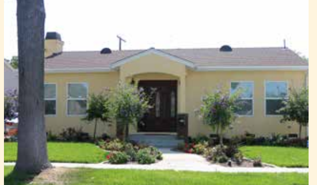
2<sup>nd</sup> Home Beautiful