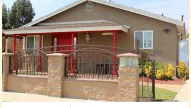
1st Home Improvement 11549 College Drive