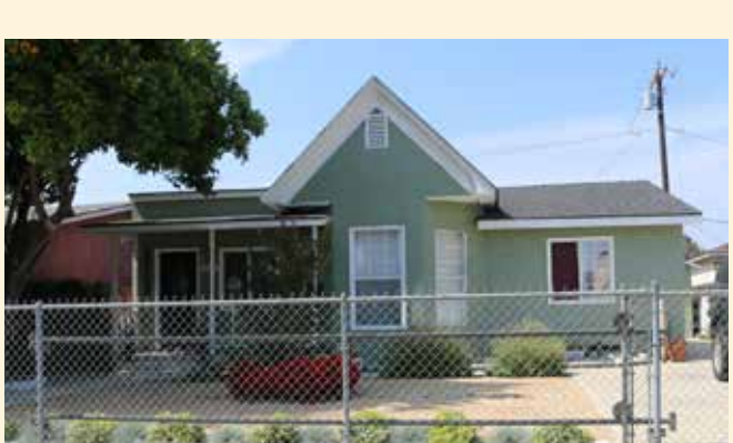
Congratulations to all the home and business owners who are working to make Norwalk the best it can be!