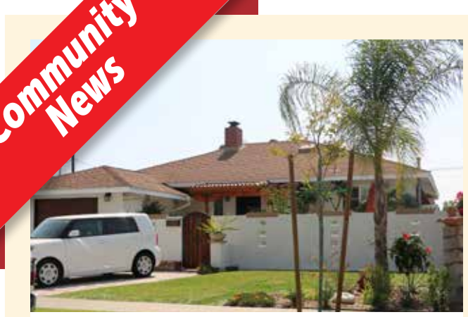
1st Home Beautiful 14529 Halcourt Avenue