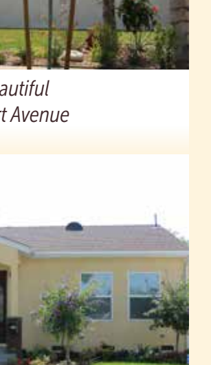
14721 Benfield Avenue