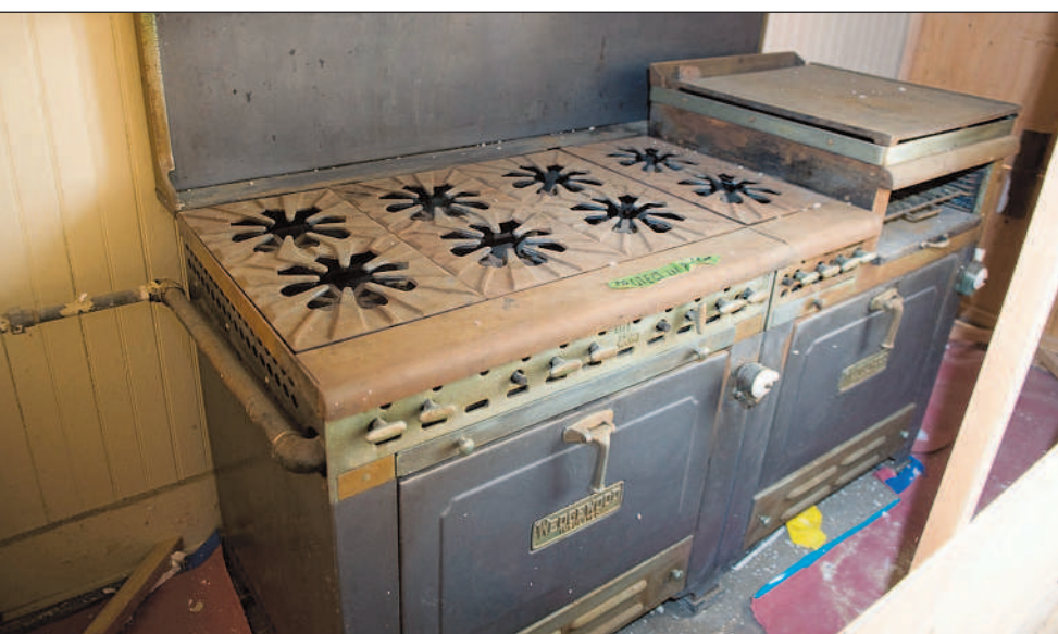
A very rusty and large Wedgewood stove from about the 1920s is still inside the old mess hall in the Irvine Ranch Historic Park.

SEE THE HISTORY BEHIND THE BUILDINGS ON PAGE 4