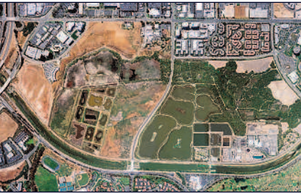
The Irvine Ranch Water District's Michelson Water Recycling Plant is undergoing an expansion.