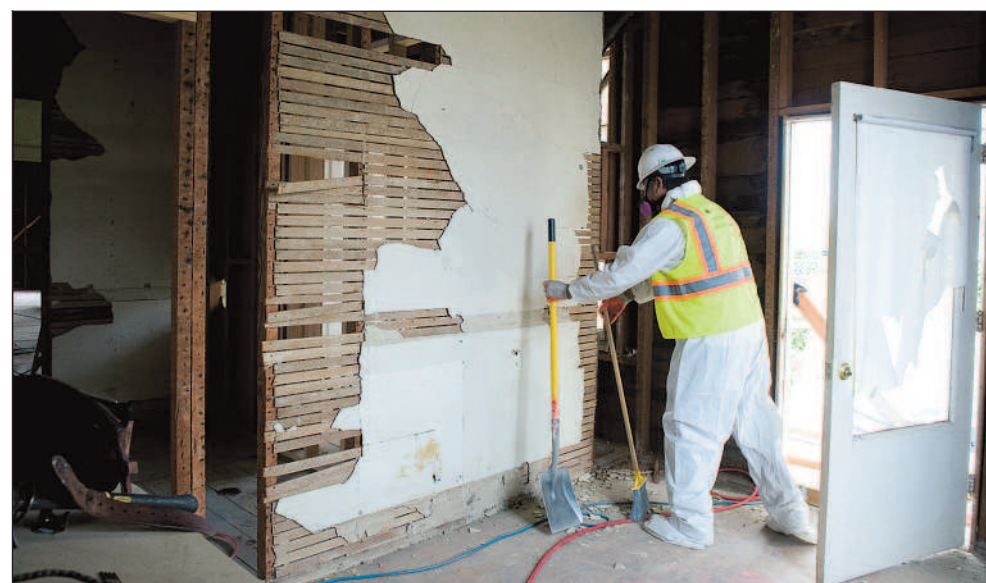
A construction worker with Spectra Co. grabs a shovel and broom from one of the rooms inside the old mess hall and dormitory building for the ranch hands.