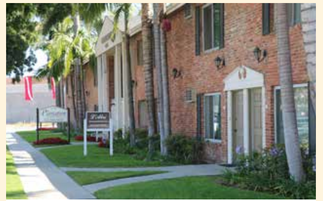
1 st Multi-Family Plantation Apartments, 12809 Kalnor Avenue