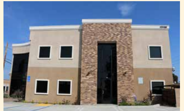
2 nd Business Miller Oh, 12106 Front Street