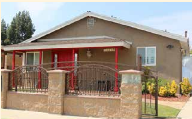
1 st Home Improvement 11549 College Drive