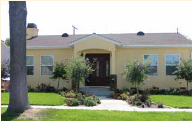
2 nd Home Beautiful 14721 Benfield Avenue