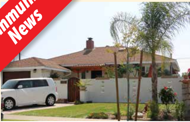
1 st Home Beautiful 14529 Halcourt Avenue