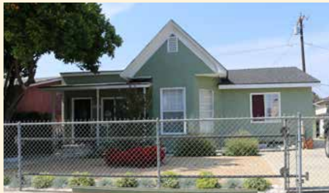
2 nd Home Improvement 12139 Chesterton Street